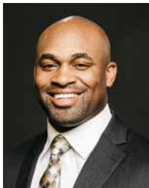
ASHTON AIKENS WIDE RECEIVERS FIELD