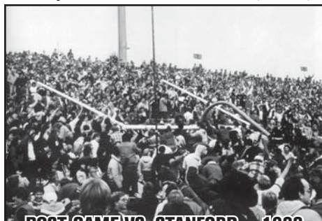
POST-GAME VS. STANFORD — 1983