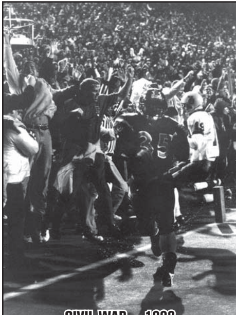
CIVIL WAR — 1998