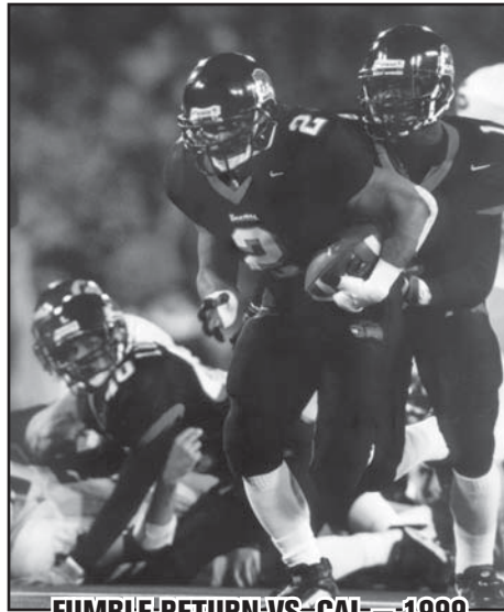
FUMBLE RETURN VS. CAL -- 1999