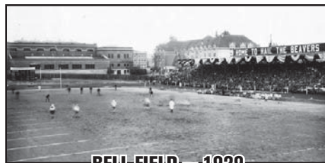
BELL FIELD — 1929