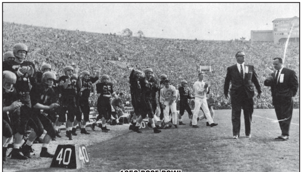
1956 ROSE BOWL