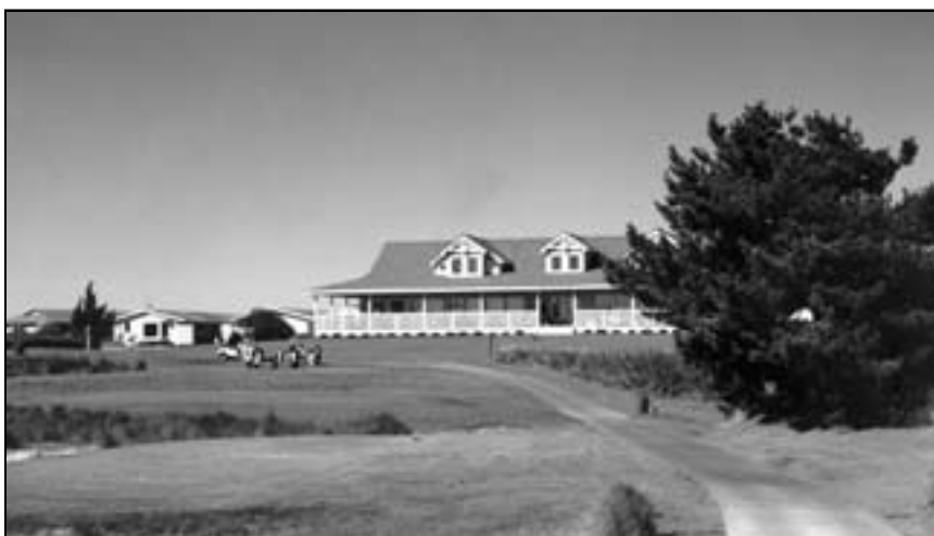
A look at the clubhouse at the beautiful Seascape Country Club in Kitty Hawk, NC

The Spivey Rental's Scholarship Golf Classic has been an important part of Old Dominion University Golf for 22 years. Proceeds from this tournament benefit the University's Intercollegiate Foundation golf scholarship fund. The tournament is a two-man, three-day best ball event (Chapman, Florida, and best ball competition). Over 200 golfers compete each June in the tournament and the event annually raises about $35,000 for golf scholarships at Old Dominion.